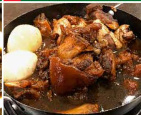
K13 猪脚醋 Pork Trotter Vinegar