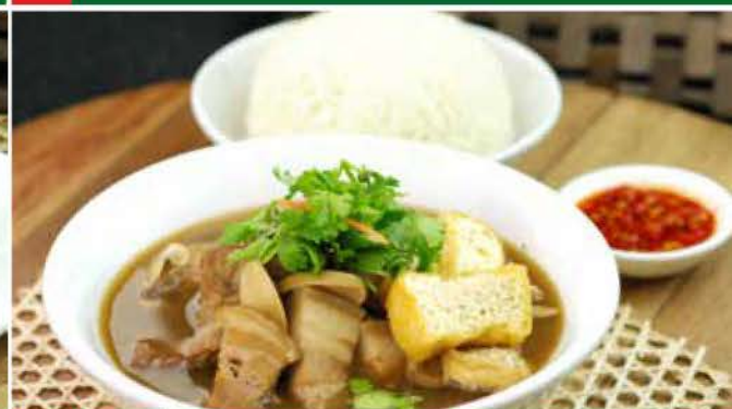
R10 肉骨茶饭 Bak Kut Teh with Rice