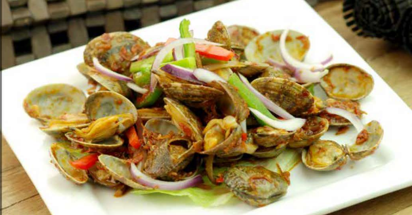
X06 X.O. 醬炒蚶 X.O. Lala (Pipi)