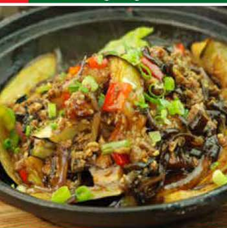
T06 渔香茄子 Claypot Eggplant with Pork