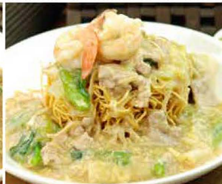
N18 广府伊面 Crispy Noodle