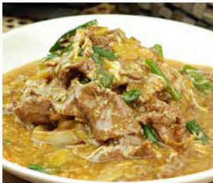
N17 姜葱牛肉河 Beef Hor Fun