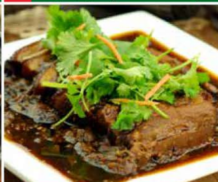
K11 梅菜扣肉 Pork Belly w/ Preserved Mustard