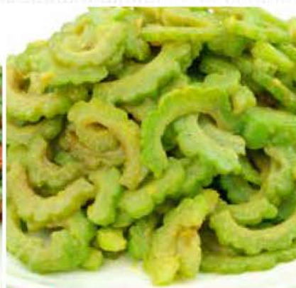
T04 炒苦瓜 Bitter Melon