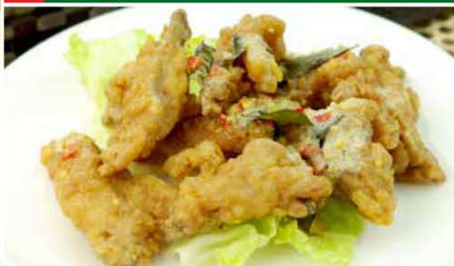
P13 黄金鸡排 Salted Egg Chicken Ribs