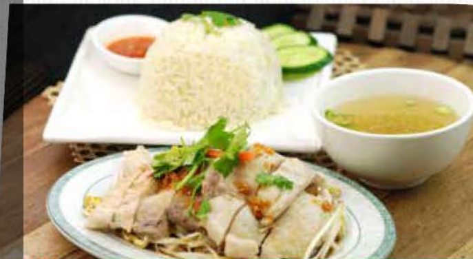
R01 海南鸡饭 Hainanese Steamed Chicken Rice