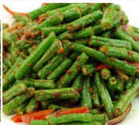
T02 炒四季豆 French Beans