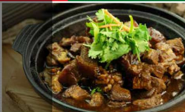
K10 辣煲花腩 Claypot Stew Pork Belly