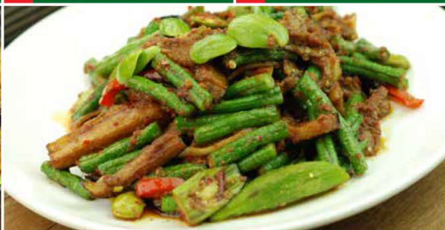
T07 四大天王 4 Seasons