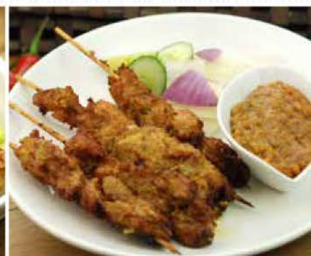
E05 沙爹鸡串 Chicken Satay