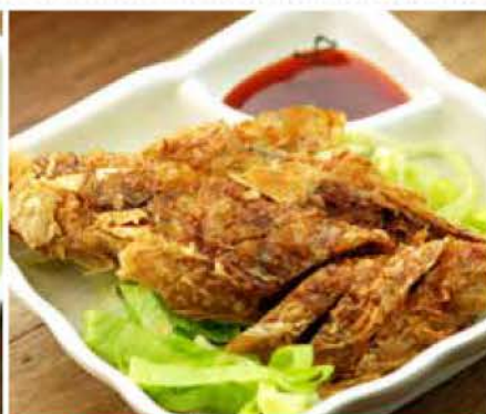
E04 五香肉卷 Lobak