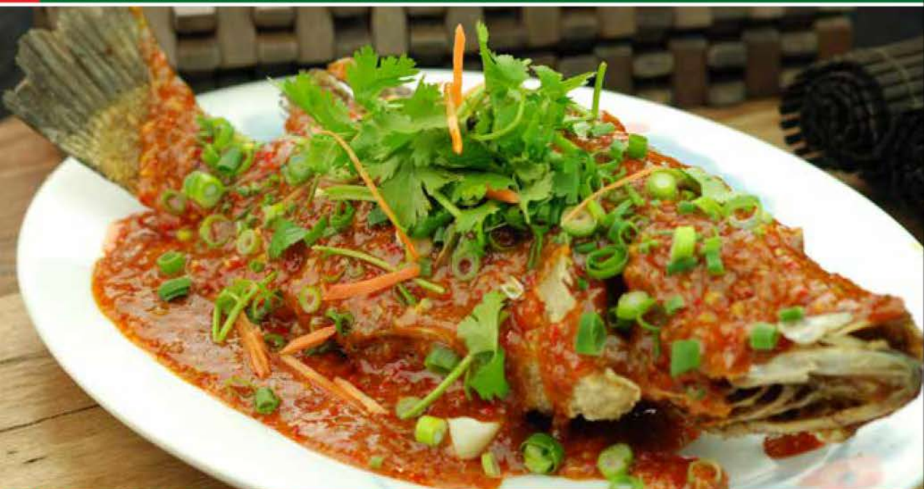
F10 酱炸盲曹鱼 Deep Fried Whole Barramundi with Imperial Sauce