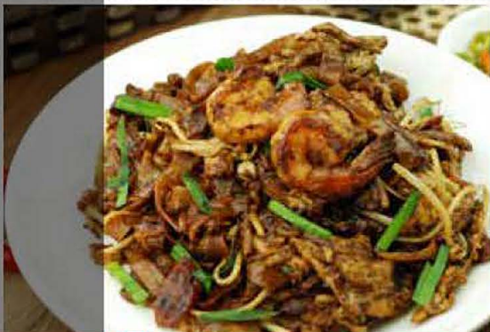
N16 炒贵刁 Char Kuey Teow

Product images for illustration purposes only. Actual product may vary. Food may contain traces of nuts and other allergens.