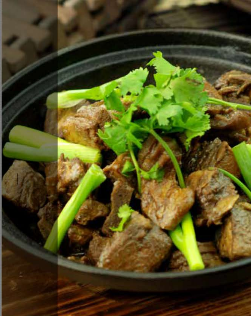
B06 马来西亚羊腩煲 Malaysian Claypot Stew Lamb Pot