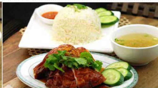
R02 海南烧鸡饭 Hainanese Roast Chicken Rice