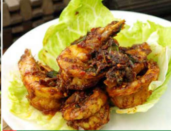
W02 金香虾 Kam Heong Prawns