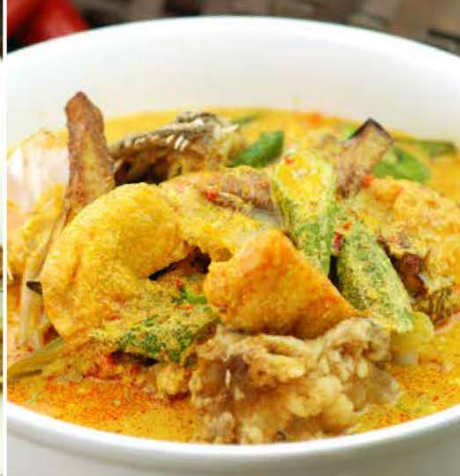
F02 咖喱鱼头 Curry Rockling Fish Head