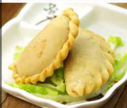
E02 素春卷 Vegetarian Curry Puffs