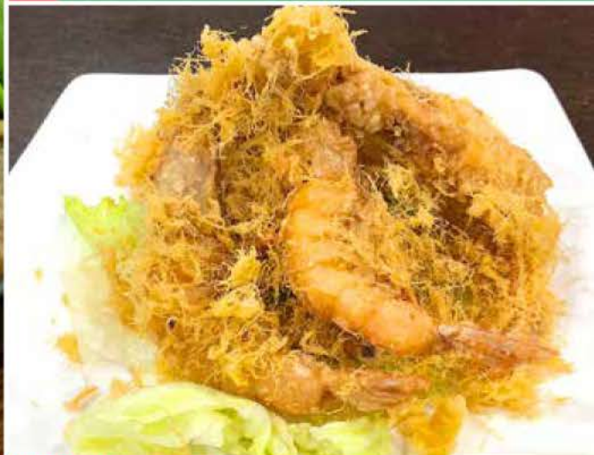
W03 奶油虾 Butter Prawns