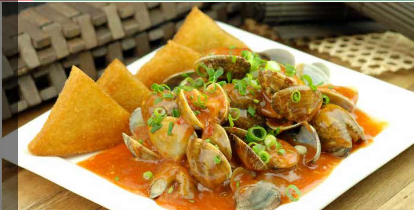
X08 辣子蚶 Lak Chee Lala (Pipi)