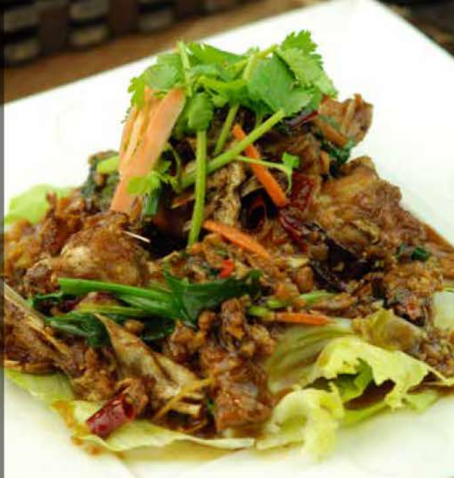
F01 招牌炒鱼头 Special Rockling Fish Head