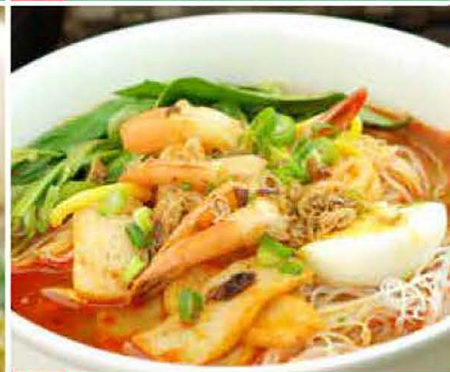
N21 虾面 Har Mee