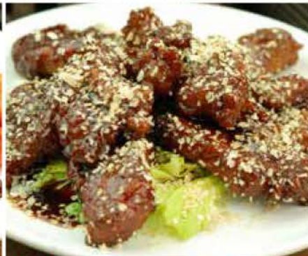
K07 妈蜜猪排 Vegemite Pork Chops