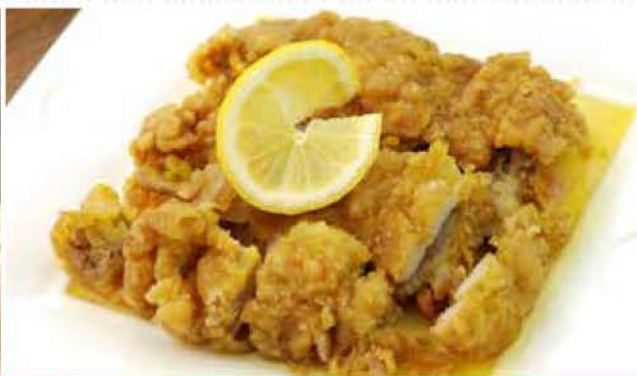
P09 柠檬鸡 Lemon Chicken