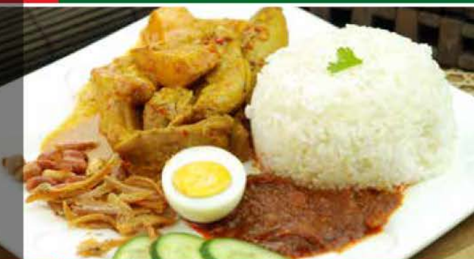
R09 咖喱鸡椰浆饭 Nasi Lemak Curry Chicken