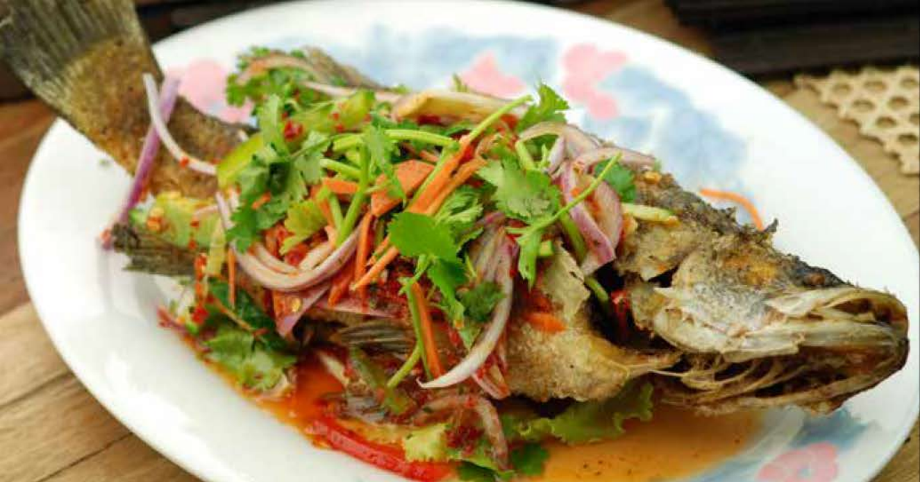
F10 油炸泰式盲曹鱼 Deep Fried Whole Barramundi with Thai Style Sauce