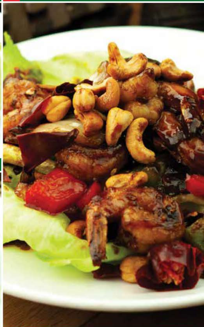
W10 宫保虾 Kong Po Prawns