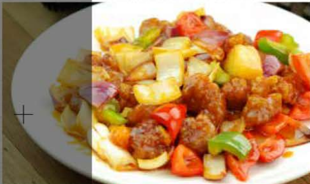
K01 咕嚕肉 Sweet & Sour Pork