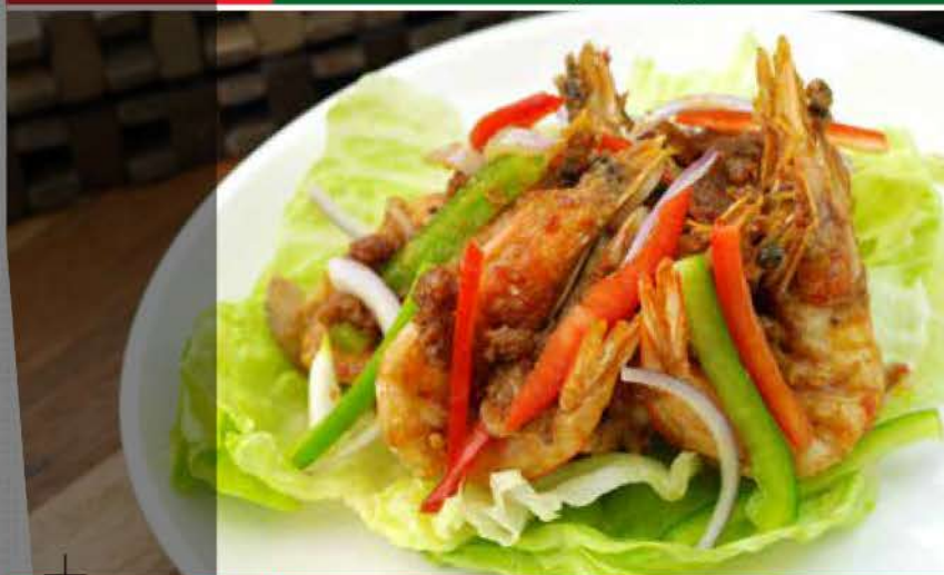
W04 娘惹虾 Nyonya Prawns