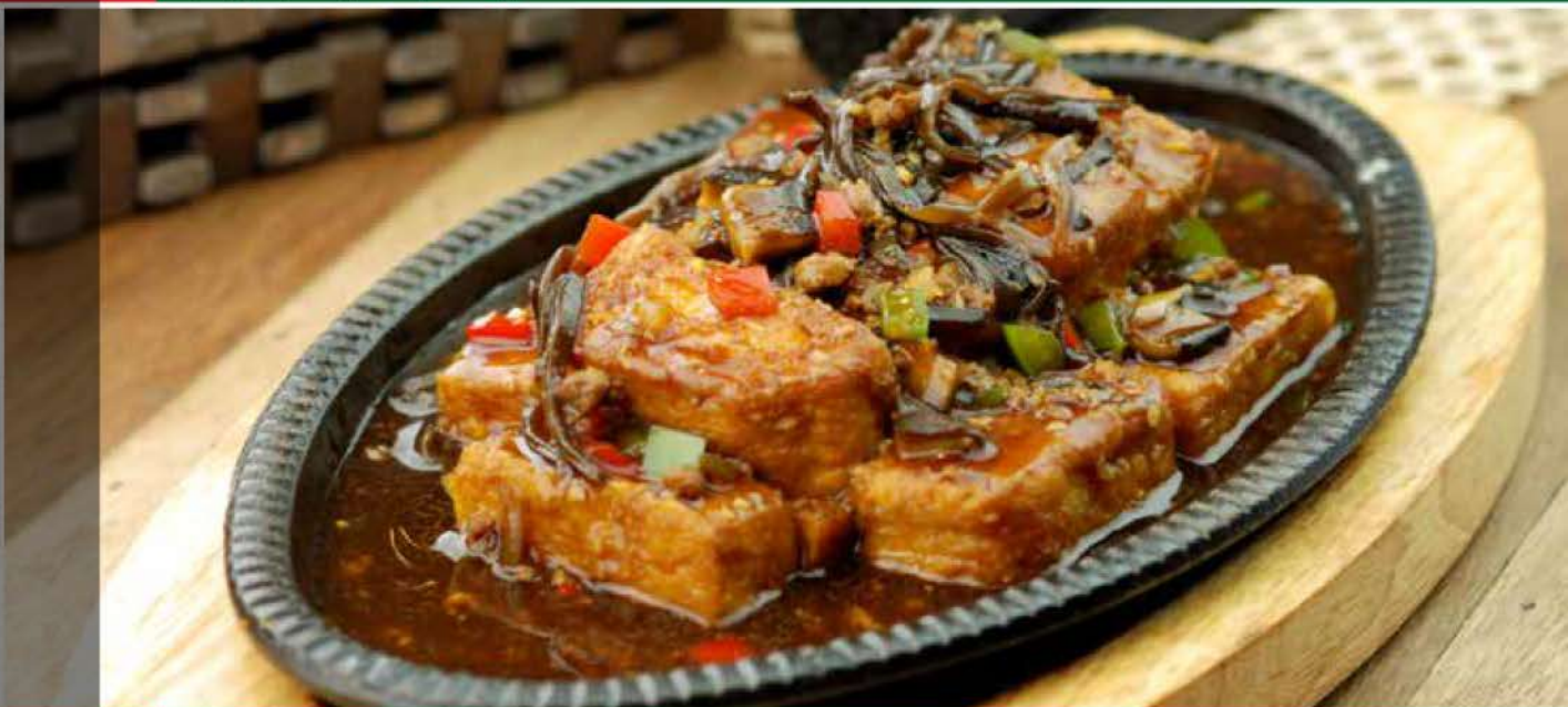
U02 自制铁板豆腐 Sizzling Homemade Bean Curd