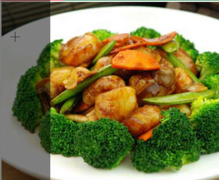
X09 西兰花炒带子 Broccoli with Scallops