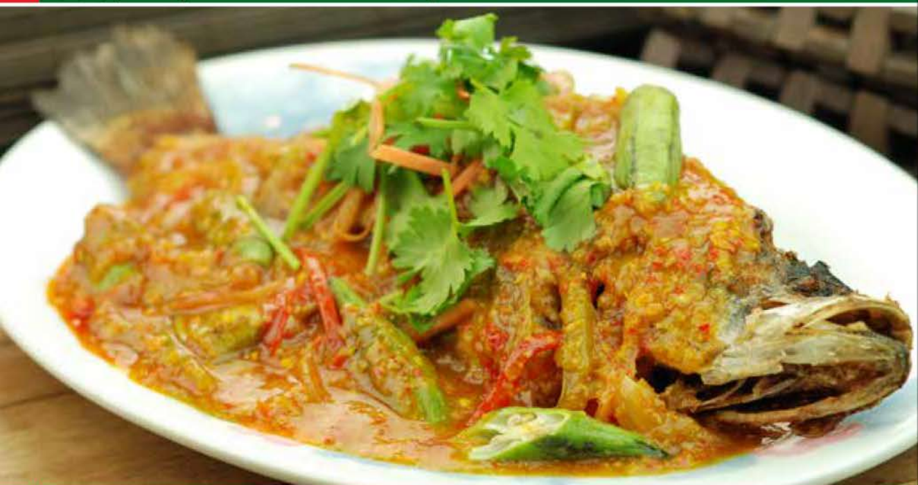
F10 油炸娘惹盲曹鱼 Deep Fried Whole Barramundi with Nyonya Sauce