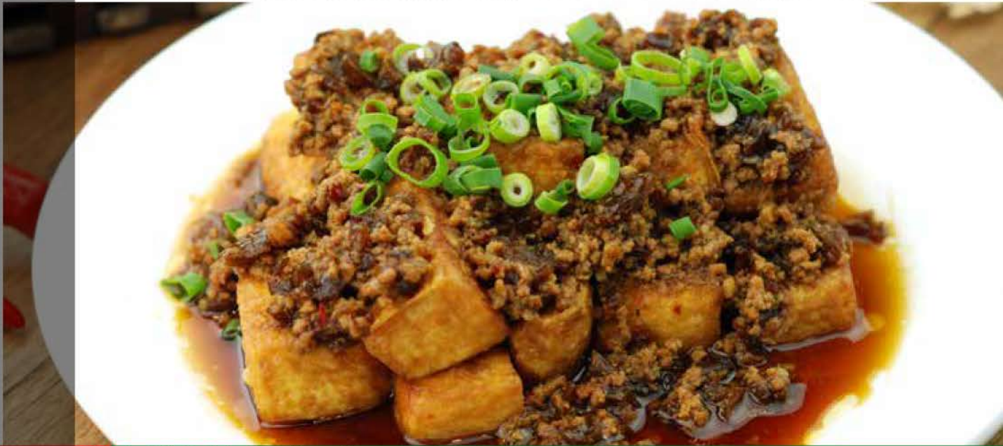
U01 自制菜香豆腐 Choy Heong Homemade Bean Curd

Product images for illustration purposes only. Actual product may vary. Food may contain traces of nuts and other allergens.