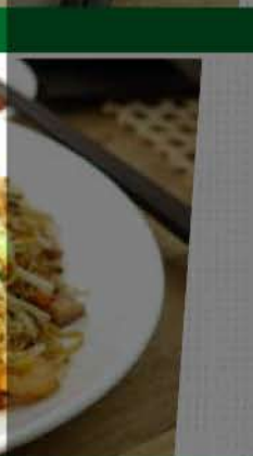
N03 砂煲老鼠粉 Claypot Rice Drop Noodle