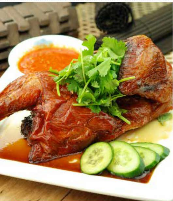
P01 烧鸡 Roast Chicken