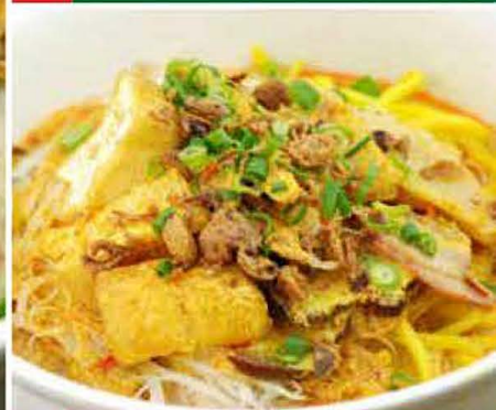
N24 咖喱叻沙 Curry Laksa