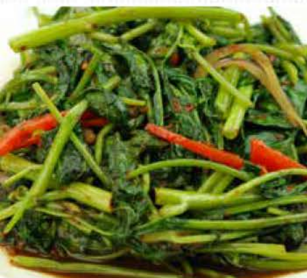
T01 炒通菜 Kang Kong

Stir fried Lotus Root with snow pea, carrot, chestnut, cuttlefish topped with cashew nut.