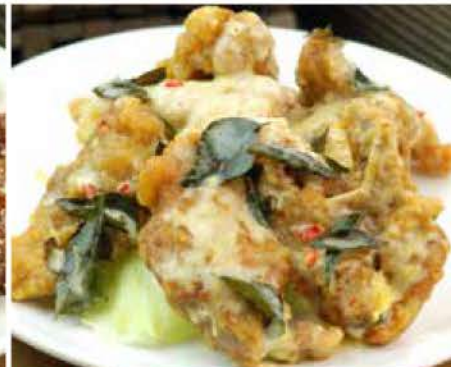
K08 奶油猪排 Oriental Pork Chops