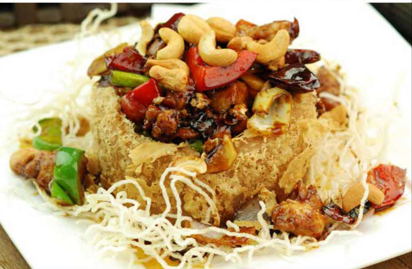
X01 佛钵飘香(自制) Yam Ring (Homemade)